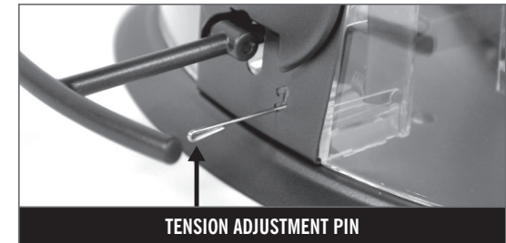
TENSION ADJUSTMENT PIN

Two integrated metal perches are spring loaded to close both ports from the weight of a squirrel.